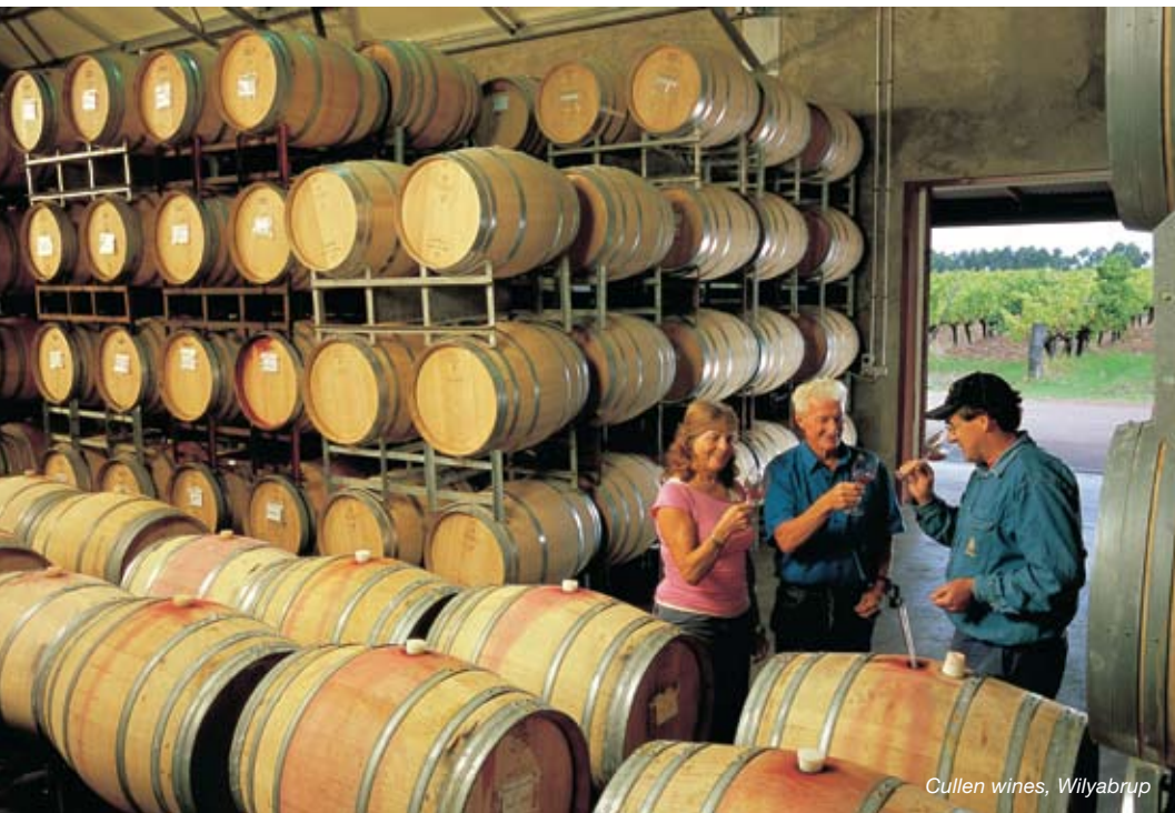
Cullen wines, Wilyabrup

Tel: +61 2 9960 5675 www.gourmetsafaris.com.au