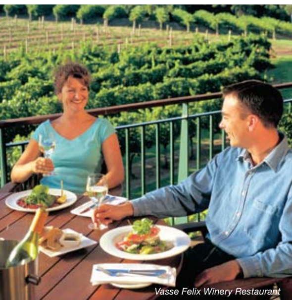
Vasse Felix Winery Restaurant