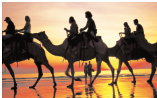
Camels may be a tourism cliché, but that doesn't mean they're not great fun.

Even when there are swimmers, sunbathers, walkers and kayakers, the beach looks mostly empty.