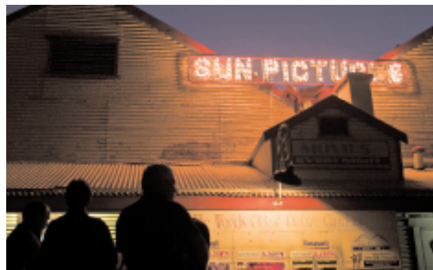
Sun Pictures claims to be the longest-running outdoor cinema in the world.